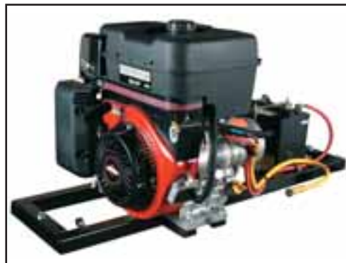
Quick Change Power Pac™