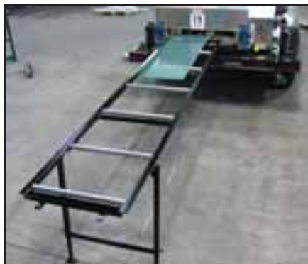
Run Out Table