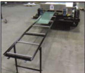
Run Out Table