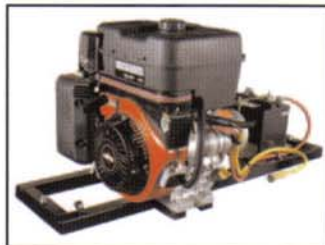
Quick Change Power Pac™