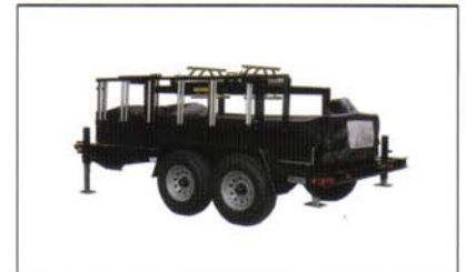
Machine w/ Cover